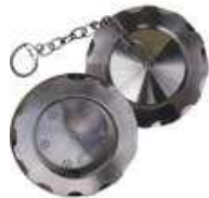
Multi MicroPort and MicroPort valves