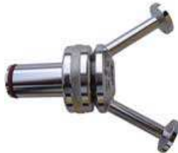
I52 Ingold valves