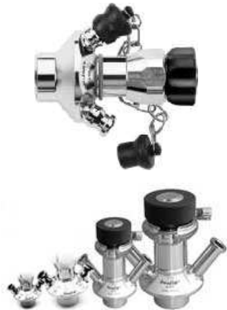
M4, W9, W15 and W25 valves